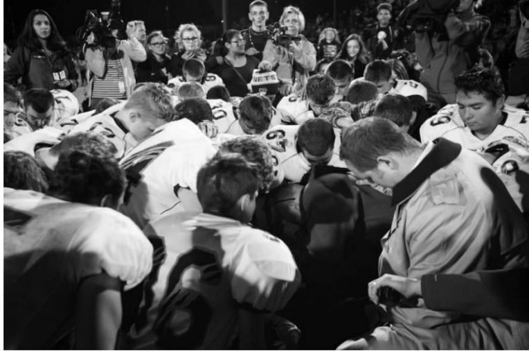
Photograph of J. Kennedy in prayer circle (Oct. 16, 2015).

the local police and to post signs near the field and place robocalls to parents reiterating that the field was not open to the public.